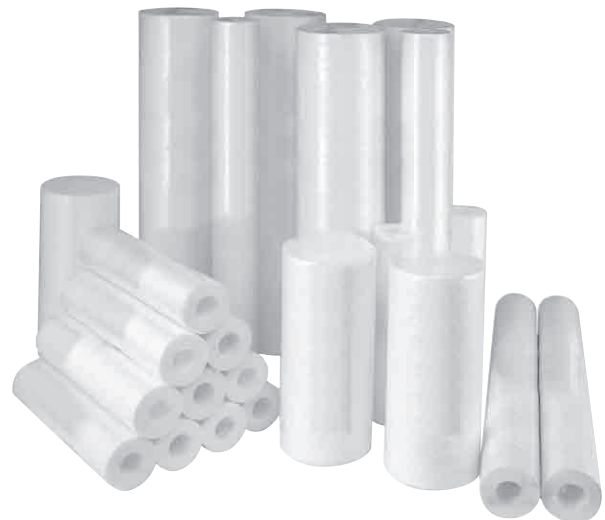
Melt Blown Filter Cartridges